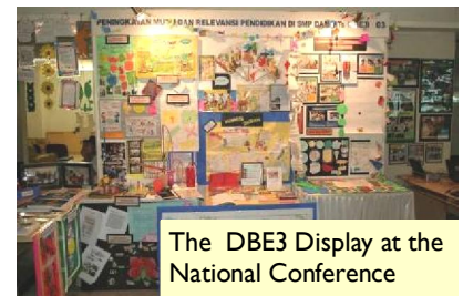
The DBE3 Display at the National Conference