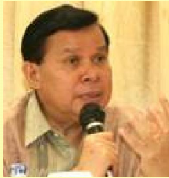
Deputy Minister of Education, Fasli Jalal