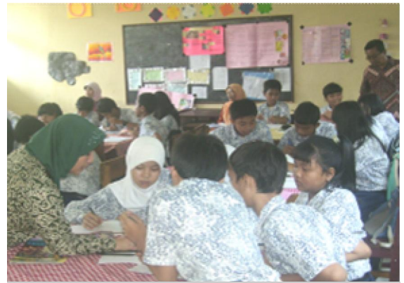
Teachers observe their colleagues teaching different subjects.

THERE are five things that I have done since our school became a partner of DBE3. (1) I have asked the teachers who participated in DBE3 training to implement the skills they had learned and share them with other teachers at meetings and in the school level subject teachers working groups (MGMP). (2) I have provided the materials teachers needed in order to teach. (3) I have conducted supervision by saying to the teachers, "I would like to see the new models of learning, how the students learn alongside the teacher and how the lesson is organized." (4) I have encouraged teachers to observe how their colleagues teach different subjects. (5) I have replicated the DBE3 training for all the teachers in the school using our own funds.