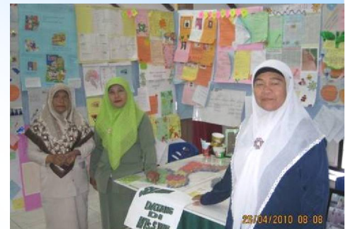
The Principal and Teachers of MTs YPMI in front of their school display in Tanjung Balai, North Sumatera

There were exhibitions of students' work, learning media, lesson plans and pictures of lessons taking place in the schools. There were also presentations by school principals, teachers, district facilitators and students about the changes that have taken in their schools. In some district there were also visits to partner schools to observe directly lessons taking place. You can read short reports of the showcases in two districts on page 5.