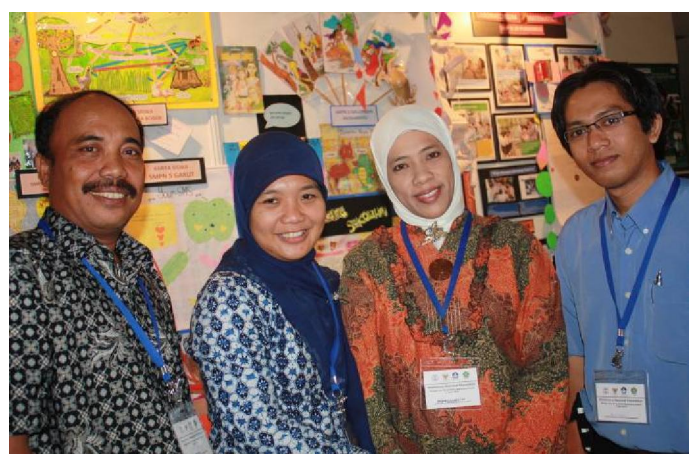
Teachers, a district facilitator and staff of DBE3 who helped prepare the DBE3 exhibition at the National Education Conference organized by USAID and GOI.