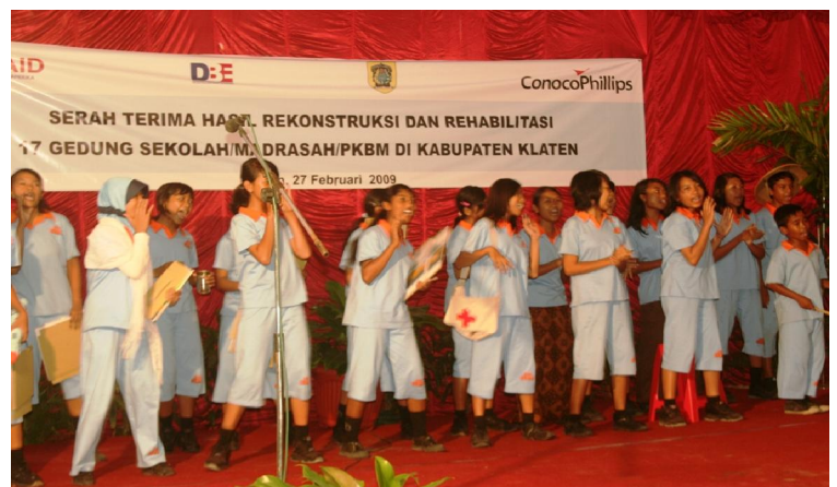
Students of SMPN I Jogonalan, Klaten , performing at the Hand Over Ceremony in Klaten

The students who performed in this event were also involved in developing a handbook on earthquake preparedness ‘ Siaga Gempa ’. The drama they performed was a way of publicizing the contents of the book. The performance was very well received.