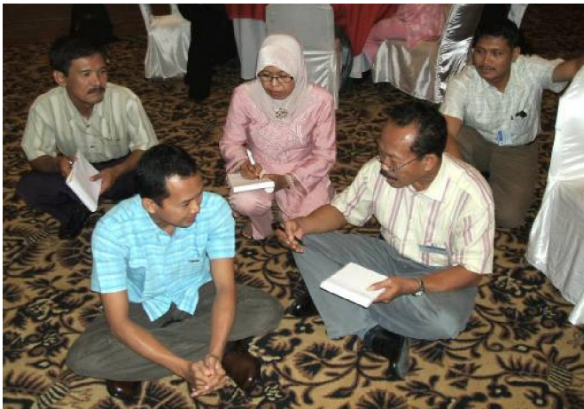
Participants in the training practicing mentoring each other

Three other activities included in the training which are directed only at DBE3 trainers (the national trainers and district facilitators ) are: