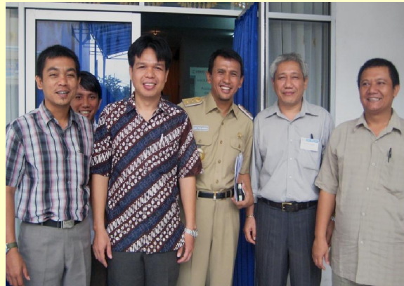
DBE3 North Sumatera team with the Vice Governor (stand in the middle) after opening ceremony at the Training of District Facilitators.

“A teacher’s duty is not only teaching students. A teacher should be a parent, a friend, or a brother/sister to his or her students. A teacher should inspire students and encourage them to